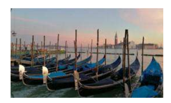
Day 9 - VENICE

At 5 pm take a Private 35-minute Venice Gondola Ride to conclude your program of tours included in this vacation package.