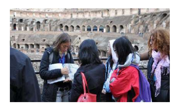
Day 3 - ROME

In the morning join our 3-hour Small Group Walking Tour of Ancient Rome. One of our expert guides will lead you on a fascinating stroll through the ruins of the Ancient Roman Forum, Palatine Hill & the Colosseum where you'll skip the long lines to enjoy a full tour of the interior of Rome's most famous landmark.